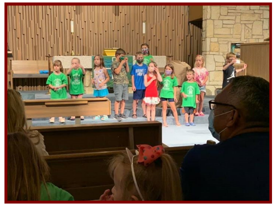
VBS Family Night