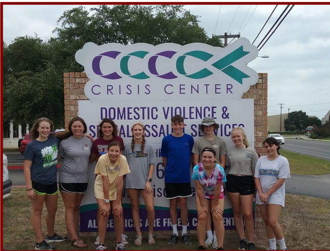
Mission New Braunfels