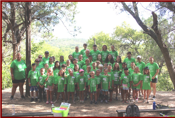
VBS at Slumber Falls

Our youth and children ministries led the way this summer by being active, staying the course when the path got rocky and giving back to the community! Through programs such as Mission New Braunfels, Camp Eagle, VBS at Slumber Falls, and VBS Family Night, St. Paul has continued to spread the love of Jesus to one another and in our community. Although our programs changed and looked a little different this summer, we persevered and spent quality time studying, hearing and sharing God's Word and love. Camp Eagle turned into a weekend, but the youth had a great time! We were fortunate to be able to combine VBS and Slumber Falls this year to have an abbreviated outdoor VBS experience for our children Kinder-5th grade and we offered a spectacular VBS Family Night that was well attended and fun for all! Mission New Braunfels was a great opportunity for us to help those at the Crisis Center and lend a helping hand to our neighbors in the community that are in need. Thank you to all the volunteers who helped make these vital programs happen and be a great success!