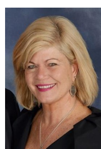
M'Lissa Steel Congregational Life